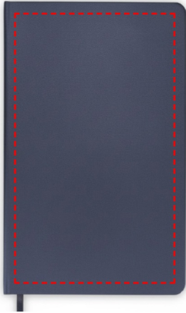
FRONT - FULL SIZE